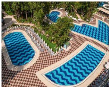
Pool3(top left), 4(middle), 5(top right)