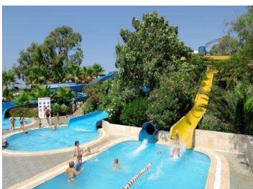
Aqua Pool 1