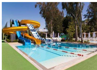
Aqua Pool 2